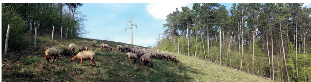
Establishment of a sheep pasture on sloped and difficult to access terrain

It is on the basis of this initial feedback that the panel of different vegetation management methods can be refined. Forest edges, ponds, restoration of natural habitats, flowered, grazed or mown meadows (see booklets 3 , 4 , 5 , 6 ), will provide opportunities for local actors to identify their strengths or weaknesses, winning partnerships or those difficult to mobilise (see booklet 8 ).