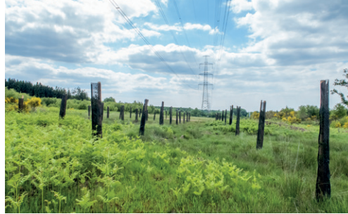
Plantation of wild apple trees, as a genetic reservoir to counteract their depletion

Based on the results of a cost-benefit analysis (see booklet 2 ) that can analyse the financial benefits over the long term of the choice of management favourable to biodiversity, a wide range of solutions can be envisaged to ensure thoughtful participative and sustainable safeguarding of forest easements.