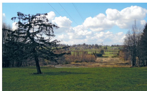
Tree topped under the electric power line

Especially in the forest environment, management of the vegetation under and around the high-voltage network is essential. The natural growth of seedlings and other regrowths must be controlled by the TSO. It is obligatory to take action regularly to ensure the continuity and safety of electricity transmission. This regular work on the vegetation can create recurring nuisances on the sites, both in terms of landscape and biodiversity.