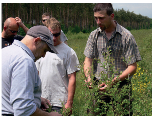
Presentation to a TSO's staff of shrubs to be prioritised in the edges

The first quality of an innovative action is to arouse the curiosity of the main players and those who can benefit from the results. Priority zones for testing this alternative management will gain by being highlighted for their educational character.