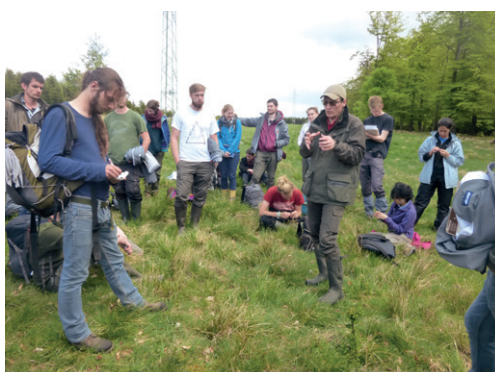
Presentation of challenges of differentiated management of corridors to students

Communication is essential and must be done via all potential channels. It must, as a priority, be first directed locally, informing neighbouring residents, the people for whom the high-voltage network is a part of the daily landscape. This targeted approach will help understanding of the TSO's willingness to incorporate its network in a territorial project. The Fêtes de la Nature organised in France and in which RTE actively participates are a good example. They allow, through children, associations and simple walkers, a demonstration of the positive impact of the developments.