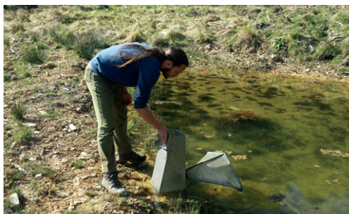
Study of the colonisation of ponds by newts by laying nets. It is not essential to inventory each pond when they are hollowed out.

It is also essential to be able to measure the actual cost of such a change in relation to vegetation. This will be a decisive tool for a potential decision of the TSO to make such methods of differentiated vegetation management general to its entire network. Such cost-benefit analyses must monopolise the enterprise's internal resources (maintenance services, financial management) and external resources (environmental engineering firms, biodiversity expert firms,...) (see booklet 2 ).